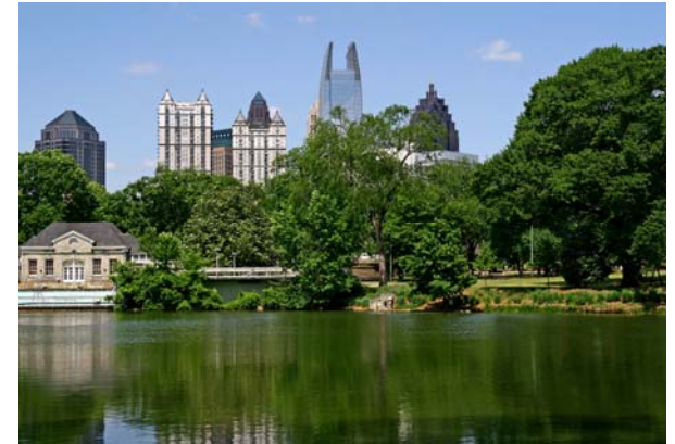
“Serving All of Georgia for Over 35 Years”

Bostwick, Duke, Harper & Worthy, Inc., has over 35 years of land surveying and construction staking experience. We are confident that we can accommodate all your surveying needs. We pride ourselves in always performing in a professional manner working within time constraints and making it a point to be available to our clients.