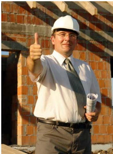
All of us at Bostwick, Duke, Harper and Worthy are proud of our "can do" attitude!

Check survey work performed by others Check plans for completeness, accuracy and errors Maintain project survey control network Offer advice on surveying requirements Plan and coordinate surveying activities Scheduling of on-site surveying Alcoholic Beverage License