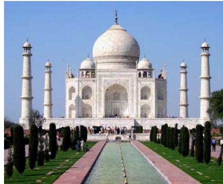
“We didn’t build it but we do have the experience and expertise”

All of us at Bostwick, Duke, Harper & Worthy, Inc., wish you great success with your projects and thank you, for the opportunity to share more about our company!